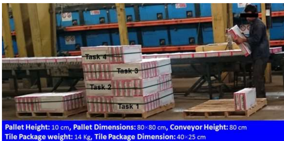
Figure 1: Loading tile packages, from conveyor to pallet

This cross-sectional study was carried out in a tile and ceramic industrial unit in Tehran, Iran, in 2016. All the employed workers were enrolled in this study by census (30 workers). All workers consented to participate in this study. The criteria for inclusion in the study included the work experience less than one year, as well as lack of a history of spinal surgery and traumatic orthopedic problems such as acute back and nerve problems, inflammatory diseases such as ankylosing spondylitis involving the spine, and congenital diseases such as scoliosis and hemivertebra; due to the mentioned factors, 5 workers were excluded from the study. To evaluate manual handling risk factors in one production line (packaging unit), the RNLE was used. Moreover, to evaluate prevalence and severity of LBP, body map questionnaire combined with a visual analog scale (VAS) was used, and LBPDI was evaluated by modified version of the ODI questionnaire. In the following, used questionnaires and tools are briefly introduced.