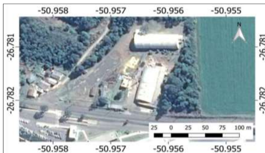
Figure 2: Location of the study area