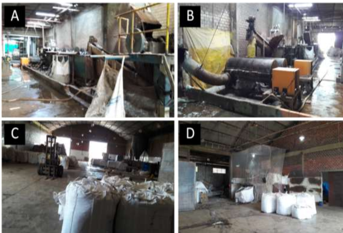
Figure 3: Plastic recycling process of the plant under study: (A) Plastic washing process, consisting of grinding mill and washing tank; (B) Process of centrifuging the washed plastic; (C) Plastic storage tank; (D) and Plastic extrusion process.

The present study was based on compliance with CONAMA Resolution 01/1990. According to this resolution, the level of sound produced during a process cannot exceed the levels established by NBR 10.152-Noise Assessment in Residential Areas, aiming at the comfort of the community (23). The analysis of variance (ANOVA) was performed on the data and the means were compared by the Tukey's test at 5% probability level using the ASSISTAT program version 7.7 beta (24).