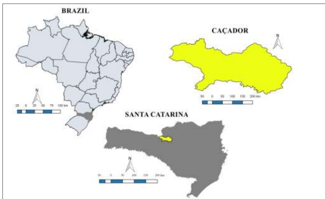
Figure 1: Location of the study area, municipality of Caçador, Santa Catarina, Brazil

The plant under study was located in the municipality of Caçador, state of Santa Catarina, Brazil, locating 26°46'30"S and 51°0'54"W, at an altitude of 920 m (Figures 1 and 2). The plant under study operates under the class IIB waste recovery process recycling plastic chips (low density and high density polyethylene). Therefore in this study, it was attempted to analyze the plant's interaction with the surroundings in terms of the noise emission.