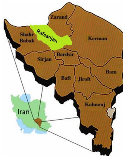
Figure 1: The geographical location of Rafsanjan County in Kerman province of Iran

This descriptive study was carried out in the year 2010 within Rafsanjan County. It should be noted that Rafsanjan County is a county in Kerman province which is located in Southeast of Iran (Figure 1). The county's population based on the 2006 census was 291,417 and the county is famous all over the world for its pistachio cultivation. In the year 2003 Rafsanjan was the largest producer of pistachio in Kerman province with 38151 pistachio producers and sharing 43.7% of all pistachio production [12].